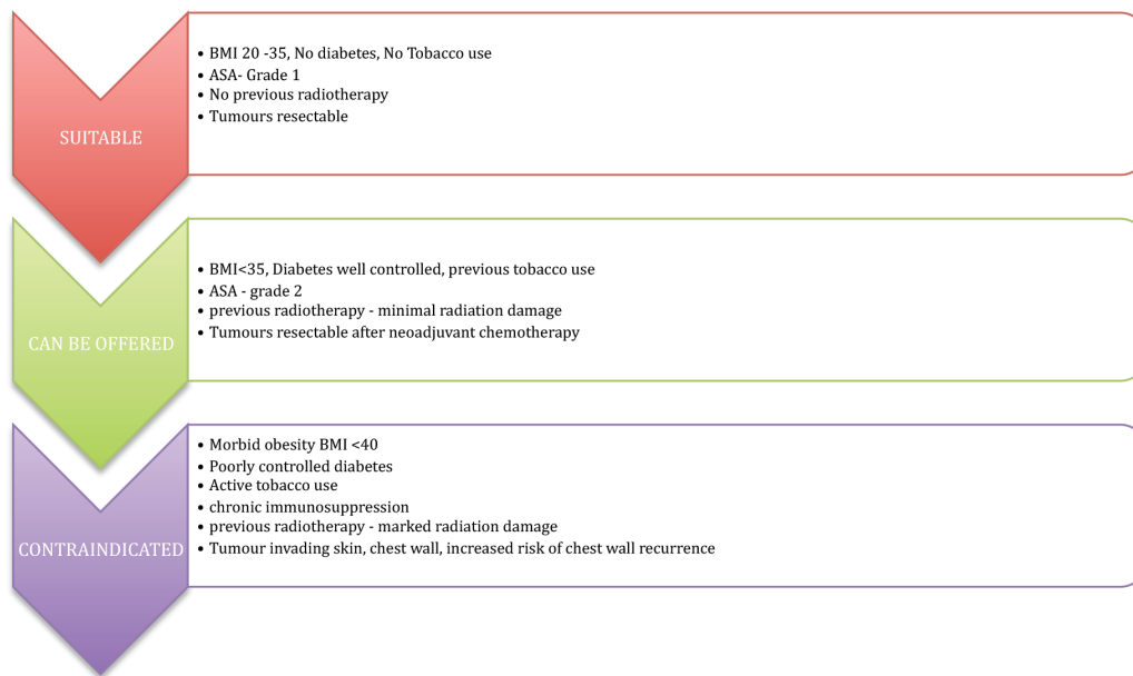
Figure 2. Patient selection is the most important criteria for prepectoral breast reconstruction.

Patient selection is vital, as the presence of risk factors is well known to be associated with adverse outcomes. An overview of the patient selection criteria is represented in Figure 2. The authors all consider that patient choice is of vital importance, particularly in patients such as athletes who prefer to maintain shoulder function and avoid damage to the chest wall muscle.