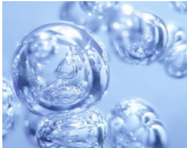
Hyaluronic Acid is a natural substance in the human body and plays an important role in connective tissue

Each ingredient is used in its most effective form, and was specifically selected for its ability to affect real results on the skin.