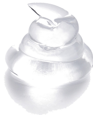
Based in a safe and delicate gel with some skin hydrating properties, providing a soft and smooth texture