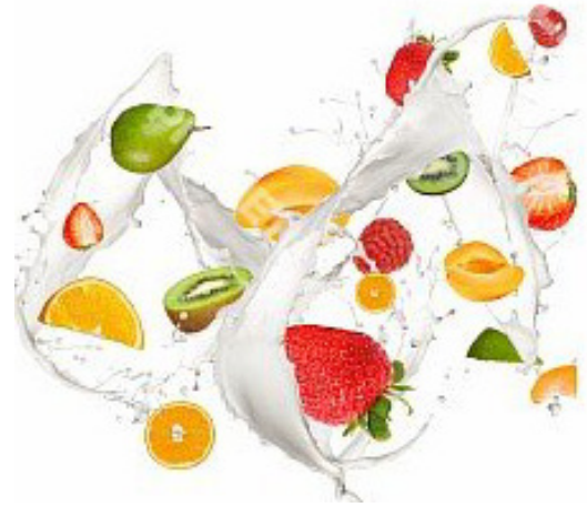
Lactic Acid is an Alpha-Hydroxy Acid obtained from various fruit and botanical sources

It has some skin hydrating properties, and heavenly smooth texture. This ensures that not only will any exfoliation treatments from Dr. Becker's Lactic Acid Gel 10% be effective, but comfortable and soothing as well.