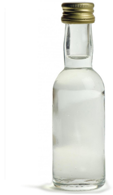
Lactic Acid deeply penetrates pores, removing any existing dirt, while simultaneously washing away dead skin cells