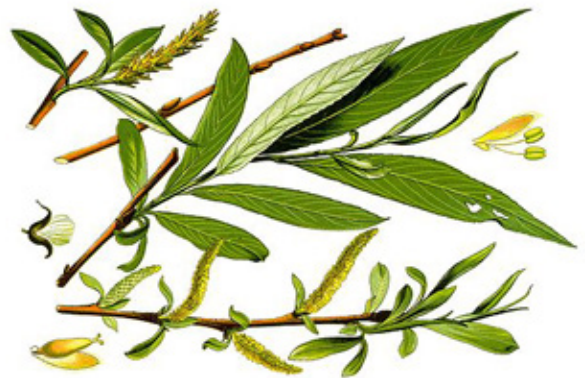
Salicylic Acid was originally obtained from Willow bark and various wintergreen leaves. Nowadays it is produced synthetically, but with the same cleansing and exfoliation properties